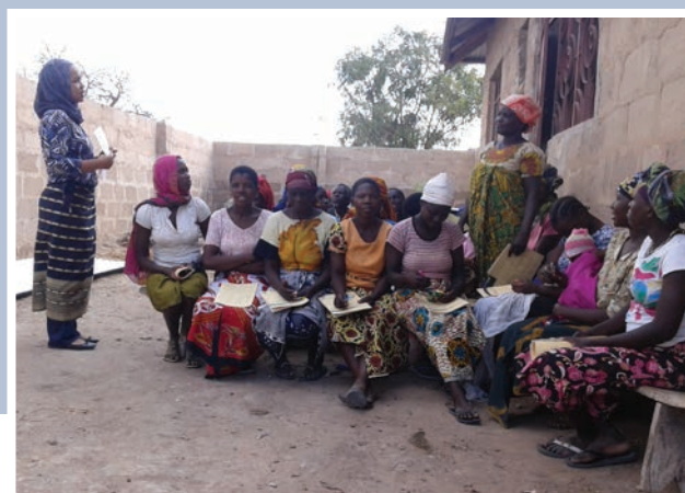
Figure 1: A Nutrition training session taking place in Idifu village

on the knowledge gap and needs identified from the baseline survey. Household nutritional training was provided to both male and female household members. In rural areas where water is scarce, the introduction of pocket/bag gardens is feasible because they require very little water compared to conventional ground gardens. Typically pocket gardens are on the doorstep, thus ensuring the immediate availability of vegetables. Pocket bag demonstrations were conducted at one central household close to the seedling nursery bed. Materials required to start pocket gardens include: manure, sand, soil, pebbles, pocket bag, water, spade, and buckets. Another type of gardening that was implemented was the 'tray' garden, where a plastic material is inserted into a square hole then filled with pebbles, dry grass and a mixture of soil, sand, and manure. Crops are planted on top. These types of kitchen