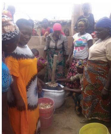
Figure 2: Pocket/bag making demonstration in progress at Ilolo