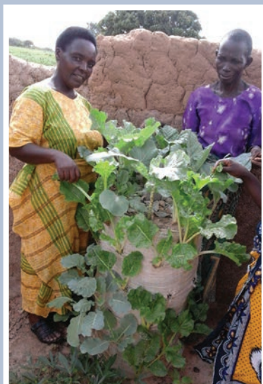
Figure 3: A Flourished spinach pocket garden in Ilolo village

garden do not need any additional economic resources, using only locally available planting materials and own labor. It can grow year round, thus ensuring a sustainable supply of vegetables, providing direct access to high quality vegetables that can be harvested, prepared and fed to household members, often daily.