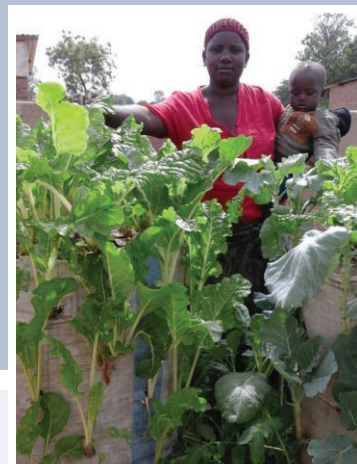
Figure 5: A happy farmer showing her Chinese cabbage pocket garden in Ilolo

MARKET: Selling surplus vegetables to neighbors results in increased income.