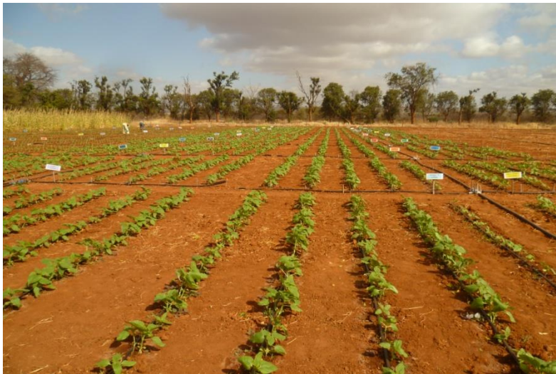
Sunflower: 9 weeks after sowing, effect of different water application rates